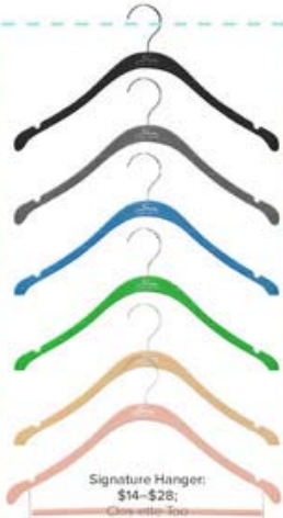
Signature Hanger: $14-$28; One with Top

Fascitelli's line of hangers, which she describes as "durable, space-saving, and garment-saving," come in an assortment of colors and styles and accommodate clothes ranging from sweaters to suits.