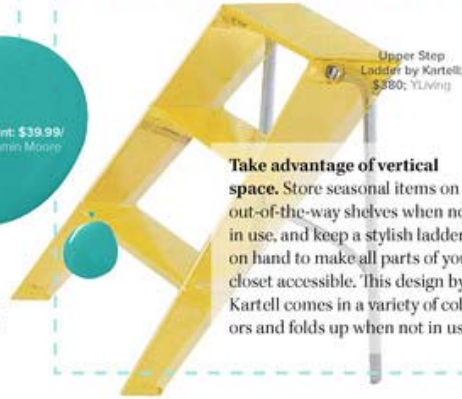
Upper Step Ladder by Kartell: $380; YLiving

Take advantage of vertical space. Store seasonal items on out-of-the-way shelves when not in use, and keep a stylish ladder on hand to make all parts of your closet accessible. This design by Kartell comes in a variety of colors and folds up when not in use.