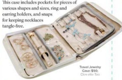
Travel Jewelry Case: $50; Clov-ette Too

Keep jewelry organized at home or on the road. This case includes pockets for pieces of various shapes and sizes, ring and earring holders, and snaps for keeping necklaces tangle-free.