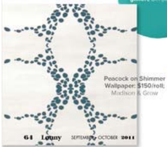
Peacock on Shimmer Wallpaper: $150/roll; Madison & Grow

Take advantage of vertical space. Store seasonal items on out-of-the-way shelves when not in use, and keep a stylish ladder on hand to make all parts of your closet accessible. This design by Kartell comes in a variety of colors and folds up when not in use.